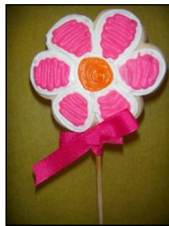
Flower (K1): $5