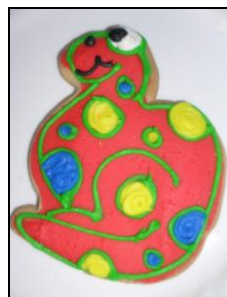
Dinosaur (K9): $5