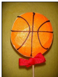
Basketball (K5): $5