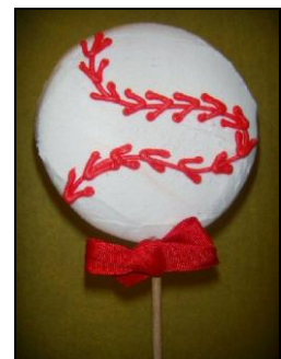
Baseball (K8): $5