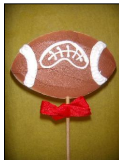
Football (K7): $5