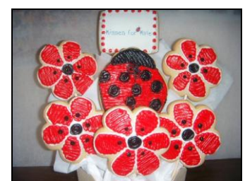
7 Kookie Bouquet: with basket (K12): $70 or 5 Kookie: $58 Includes Shipping (will ship directly from bakery)

Each Kookie measured approximately 4"-6" tall and 3/8"-1/2" thick and is about 4 ounces each. *Please note; some Kookies are shown with sticks and ribbons which are for promotional purposes only. All Kookies will be delivered wrapped, without sticks & ribbons, unless part of a bouquet.