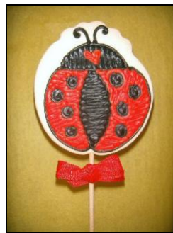
Lady Bug (K4): $5