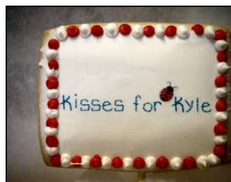
Square (K10): $5