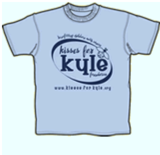
Kisses for Kyle T-Shirt