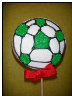
Soccer Ball (K6): $5