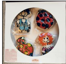
6 Kookie Box/any assortment (K11): $30